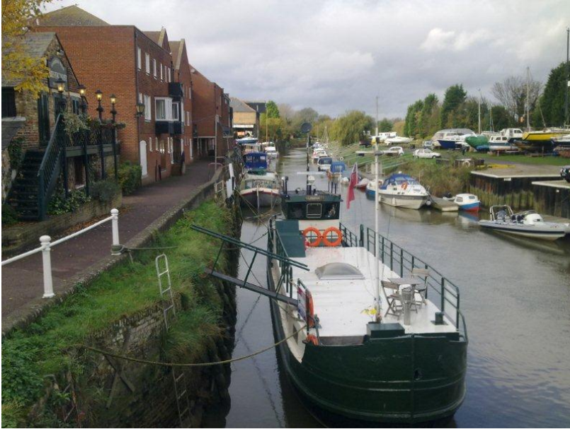
Aynsley Court – before and after