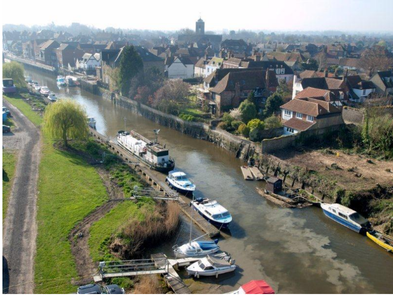
Near Gazen salts after