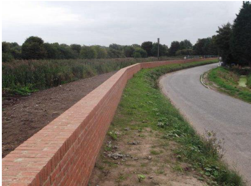
Richborough Road flood wall