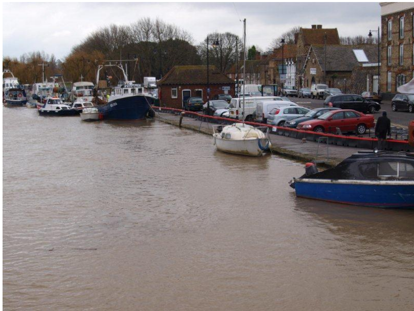
Sandwich quay – before and after