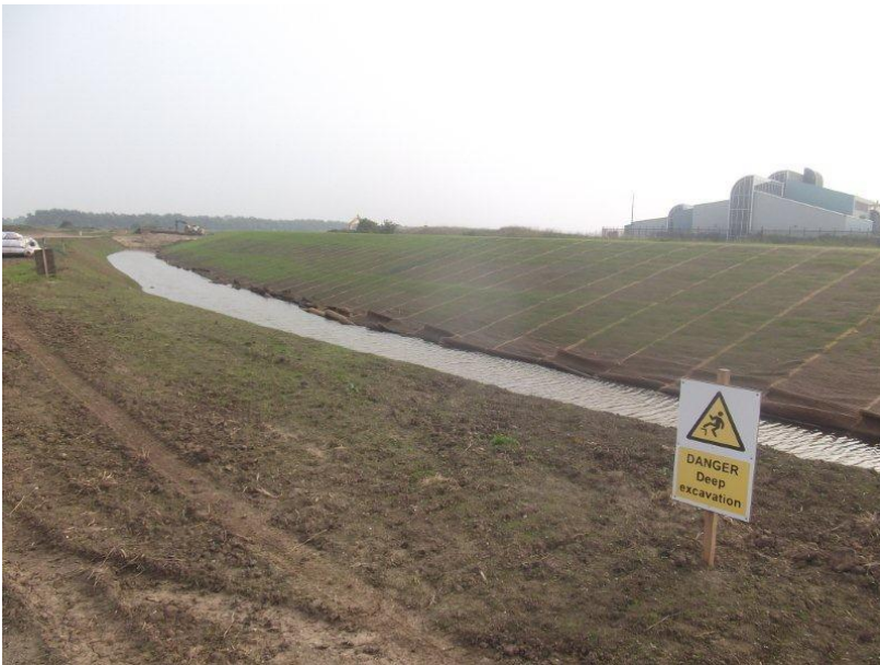
Broadsalts tidal storage area